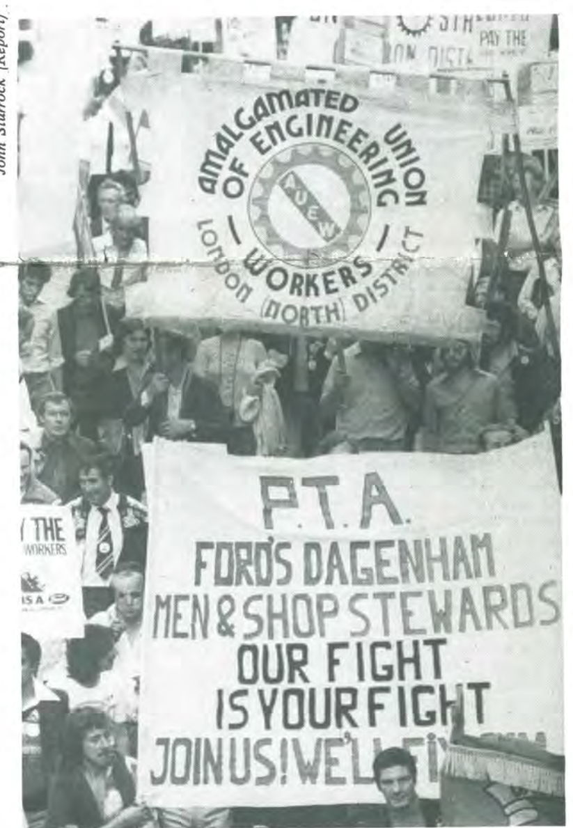
Fords march: widespread hostility to the 5% must be turned into joint action

However, it is not enough to call simply for militancy from the workers in dispute. A political lead is desperately needed.