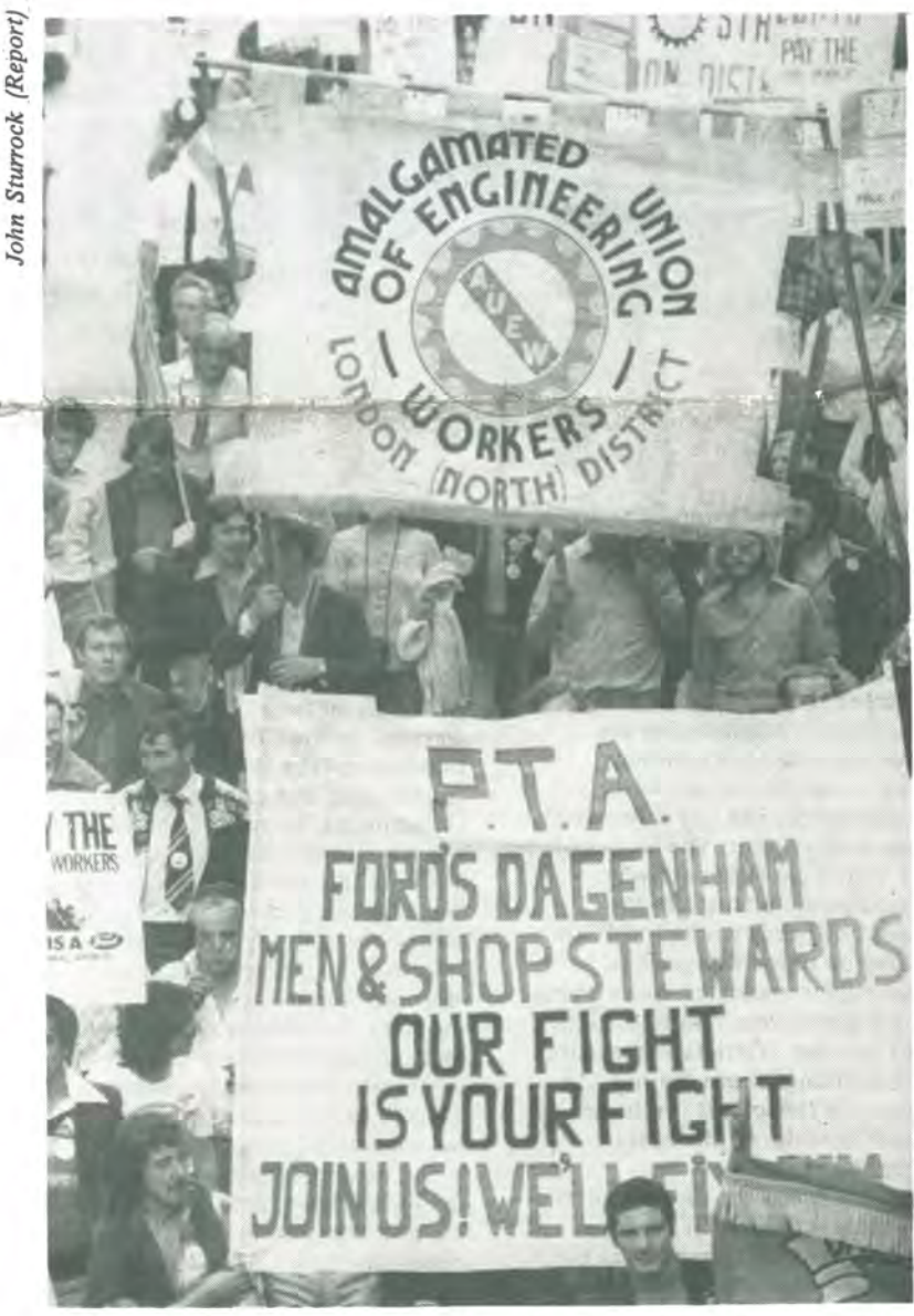
Fords march: widespread hostility to the 5% must be turned into joint action

However, it is not enough to call simply for militancy from the workers in dispute. A political lead is desperately needed.