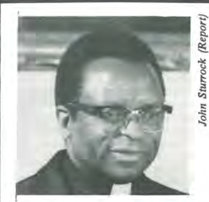
United African National Congress Abel Muzorewa

The importance that the imperialists attach to the future of Zimbabwe underlines the fact that the struggle for power in that country cannot be divorced from the international setting. The